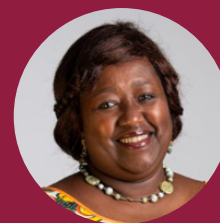
Professor Agnes Binagwaho, MD, M(Ped), PhD

Director of Global Programs The Susan Thompson Buffett Foundation Omaha, Nebraska